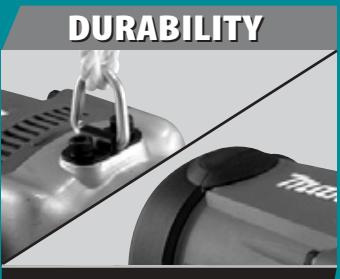
Rubber bumpers for protection and sky hook for continuous use, jobsite portability and tool storage

Makita's large, efficient hammer provides greater impact power for optimal jobsite results