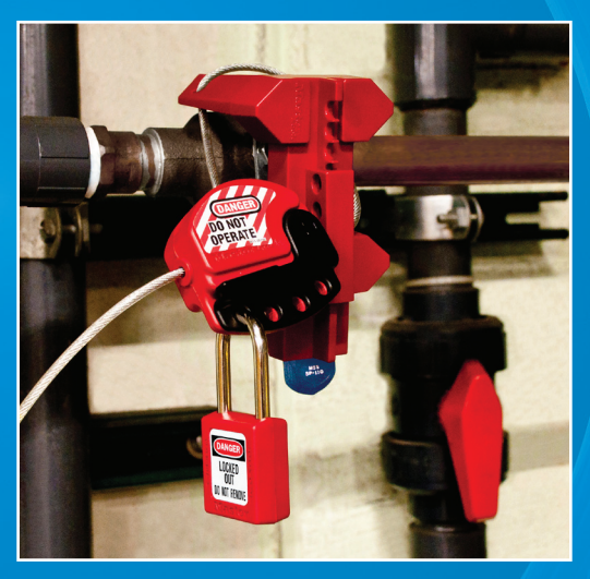
S3081 secured with S806 cable lockout device