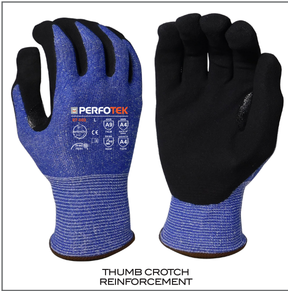
THUMB CROTCH REINFORCEMENT