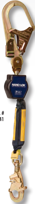
MODEL # 3101241