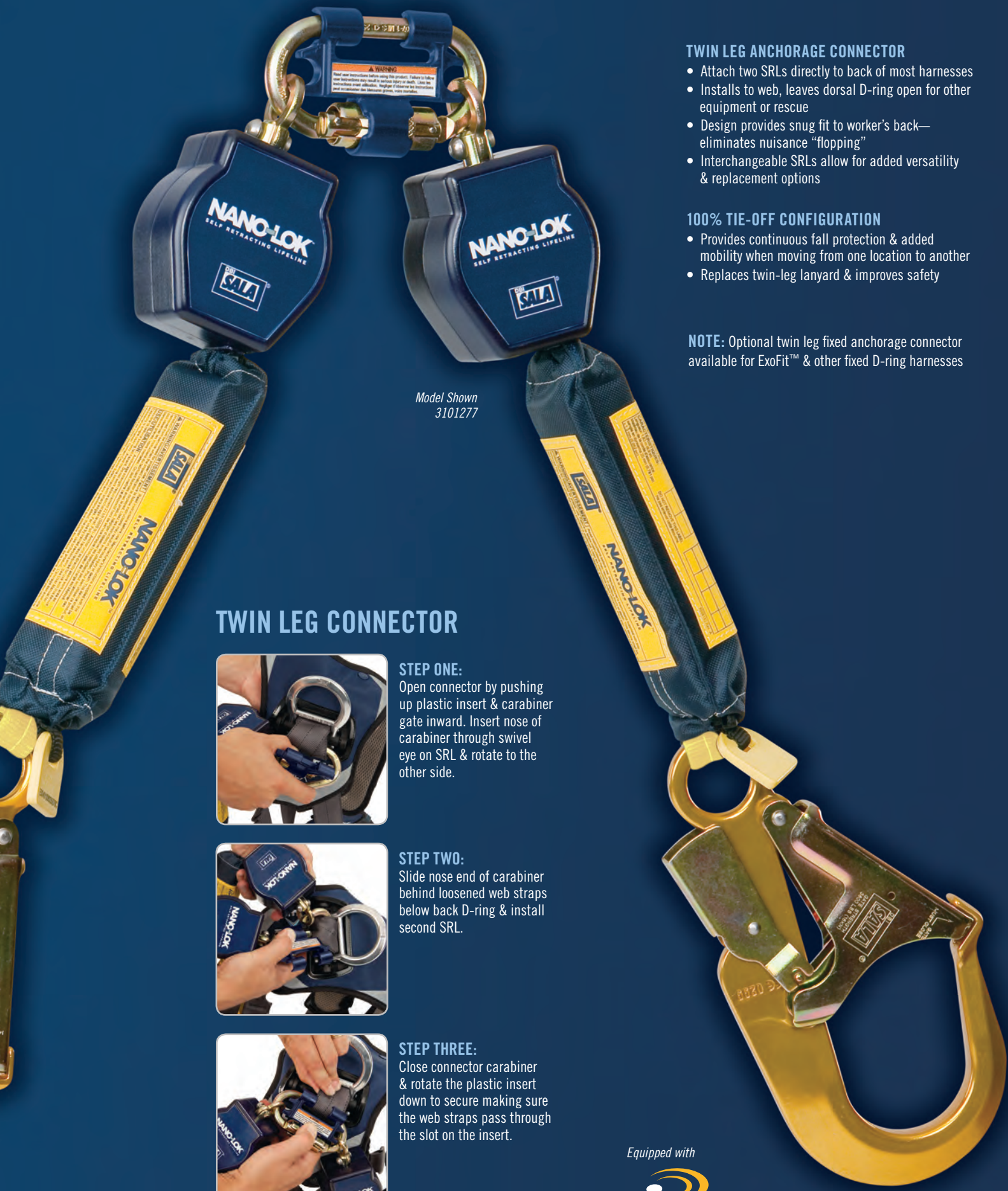
Model Shown 3101277