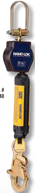
MODEL # 3101240