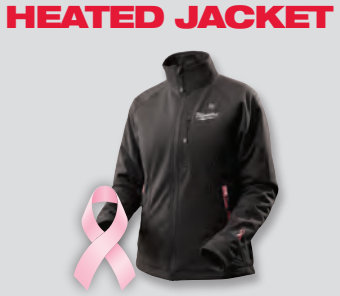
Heated Jacket Kit

REDLITHIUM™ Compact Battery, M12™ Battery Holder, M12™ LITHIUM-ION Battery Charger