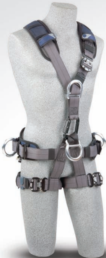
1113348 EXOFIT NEX™ ROPE ACCESS AND RESCUE HARNESSES